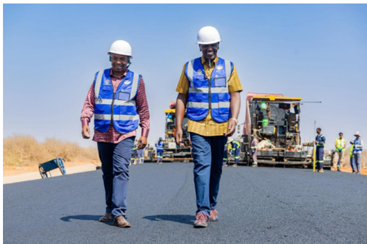
Northern Kenya: H.E President William Ruto, together with D.P Kithure Kindiki, inspected progress on the Kulamawe-Garbatulla section of the 750 km Isiolo-Mandera Road on 11th February, 2026. The project is part of the Horn of Africa Gateway Development Project aimed at improving regional connectivity.