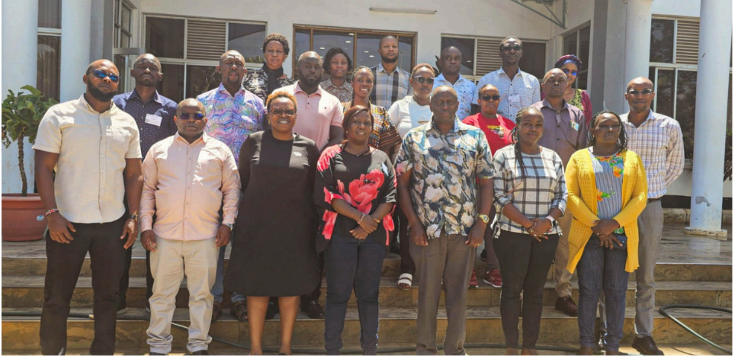
State Department for Roads Risk Management Committee members pose for a group photo during their session at the Kenya School of Government (KSG), Embu.

The State Department for Roads has developed an Institutional Risk Management Policy Framework to strengthen governance, enhance accountability, and improve service delivery across the sector.