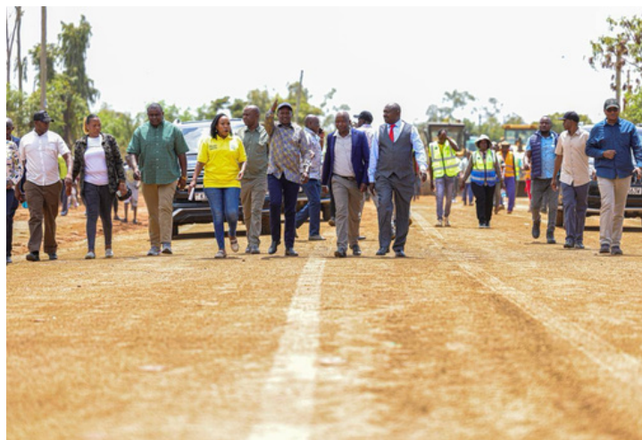
H.E. Deputy President Kithure Kindiki led an inspection tour of the ongoing construction of the critical PI-Murinduko-Ndindiruku-Marurumo-Gategi-Gatuiiri-Mutithi-White Rose Road in Mwea, Kirinyaga County on 25 th February, 2026.