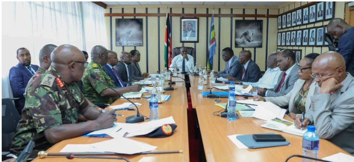
A high-level multi-agency team convened on 17 th February to review progress on the construction of the Isiolo–Mandera Regional Road Corridor.

To accelerate the delivery of critical infrastructure in Northern Kenya, a high-level multi-agency team convened on 17 th February, 2026 to review progress on the construction of the Isiolo–Mandera Regional Road Corridor.