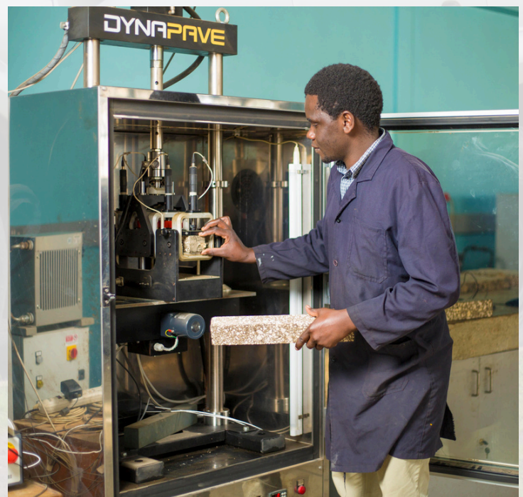
The indirect tensile testing equipment that determines the resilient modulus, creep and fatigue of bituminous mixes.

The Directorate also undertake Monitoring and evaluation of the structural and functional performance of pavements is also carried out to facilitate planning and preparation of road investment programs and annual work plans by various sector players.